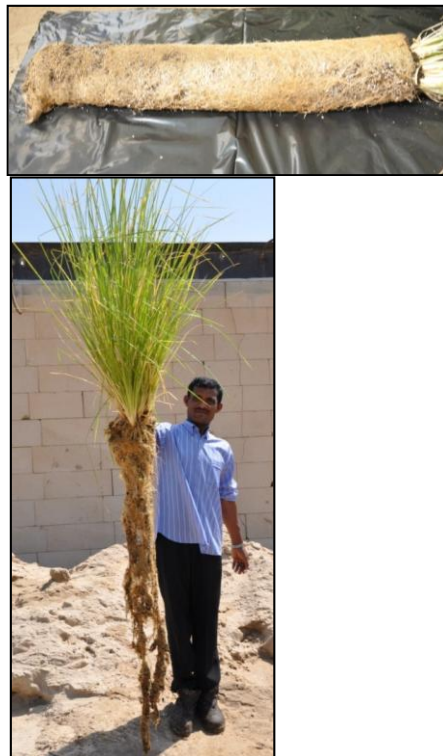
Fig 4. Vetiver plant at 180 DAP