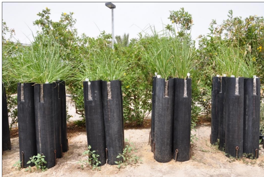
Fig 2. Vetiver root length experiment.

10m) (Fig. 2). Each 10m x 10m section accommodated 10 cultivars and each cultivar was planted in 1m x 10m sections. Plant and row spacing was 25 cm and 1m respectively, in each section. In each row there were four planting holes with three slips per planting hole for each cultivar. In each replication, 120 slips of each cultivar were planted in 40 planting holes. Control plot was devoid of any plantation.