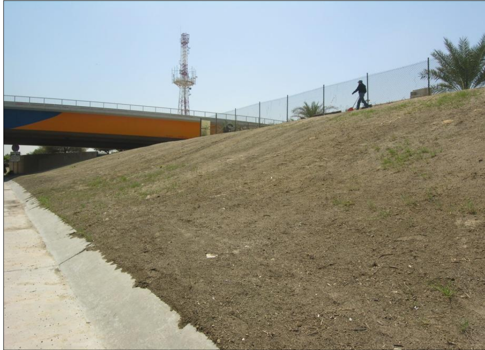
Fig 1. Overview of the selected site with Vetiver plantation at Surra, Kuwait.

depth and the texture ranges from sand to loamy sand with low mineral holding capacity with sparse vegetation and characterized by low organic matter, nitrogen, phosphorous, and alkaline in nature due to high amounts of calcium content [6]. Plants used for vegetative planting along slopes are selected based on their adaptability, growth performance and potential under the prevailing local arid conditions for their aesthetic looks, soil stabilization, and afforestation values. The selected plants should be non-invasive, less demanding and produce deep roots.